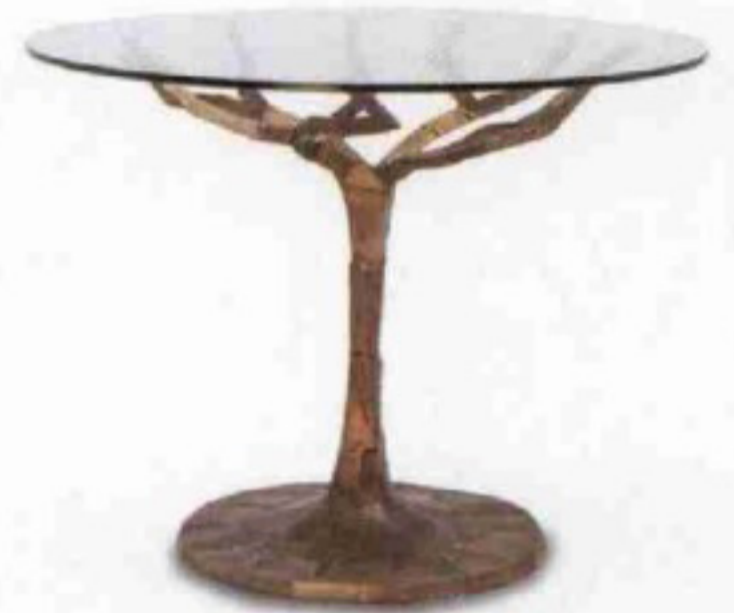
MADE GOODS "CLIVE" TABLE ($4,200/MECOX)