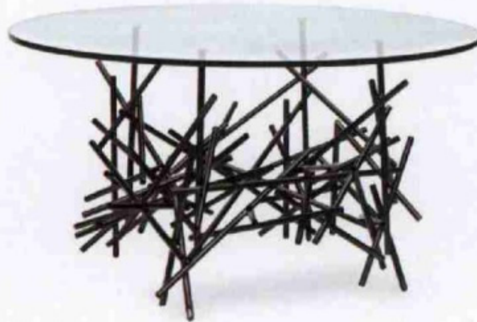
NOIR "NEST" SIDE TABLE ($1,005/MECOX)