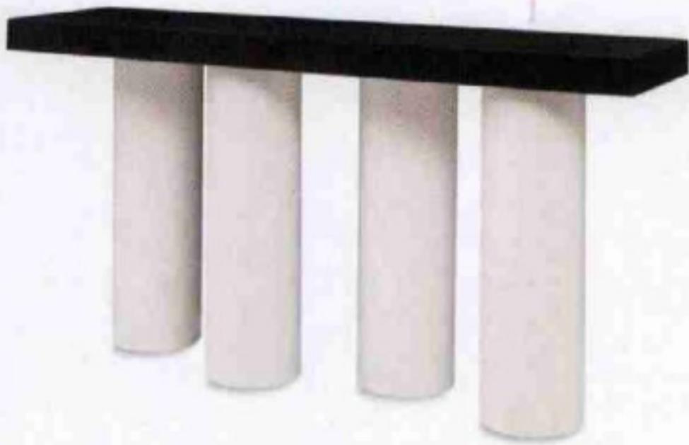
KELLY WEARSTLER RHAPSODY CONSOLE TABLE (TO THE TRADE/LEE JOFA)