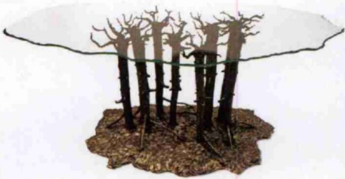
ROSE TARLOW "THE FOREST CANOPY TABLE" (TO THE TRADE/DAVID SUTHERLAND)