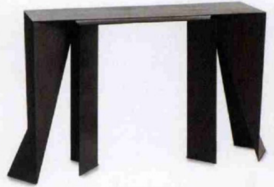
ALEXANDER LAMONT ETCHED TWIN CONSOLE (TO THE TRADE/JEAN DE MERRY)