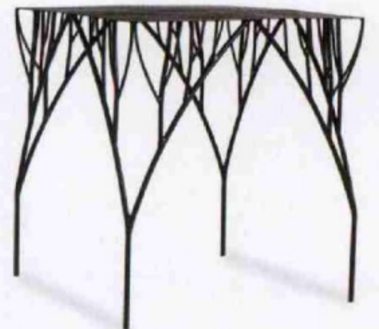
GRESHAM END TABLE ($1,650/ARTERIORS)