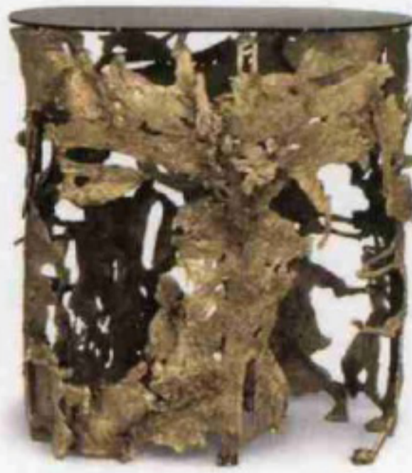
BRABBU "CAY" CONSOLE ($11,480/)