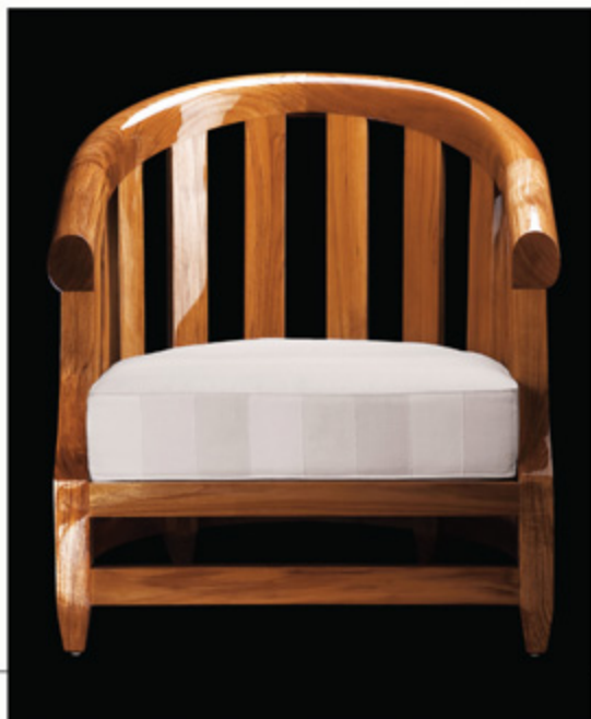
CLASSIC TUB CHAIR

David Sutherland Inc. 979 3rd Avenue, New York, NY, 212.871.9717 davidsutherlandshowroom.com